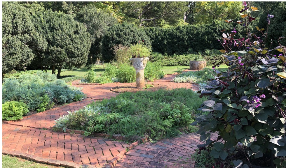
The Anne duPont Garden at James Madison's Montpelier