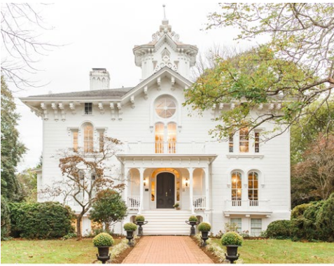
LUXURY BED & BREAKFAST MAYHURST ESTATE ORANGE, VIRGINIA c.1859